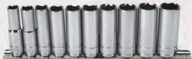
Part No. SN22501