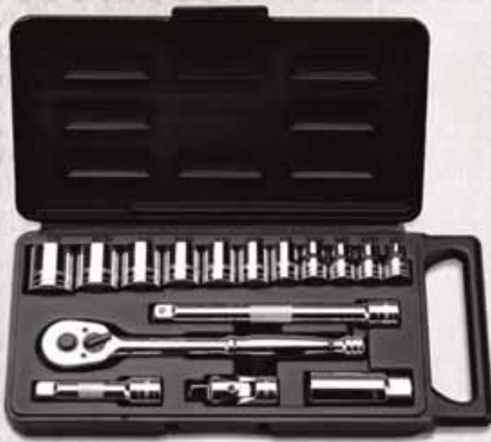
Part No. SN20001