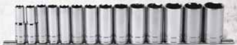
Part No. SN32501