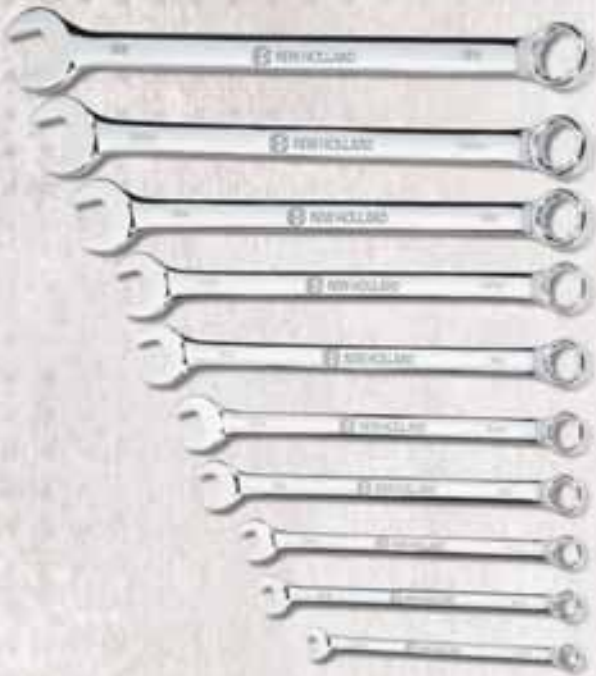
Part No. SN60501