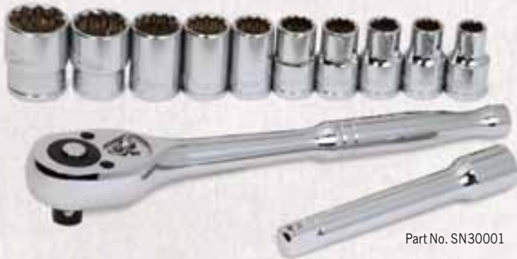
Part No. SN30001