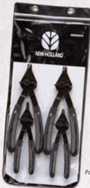
Part No. SN90004