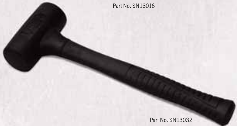
Part No. SN13032