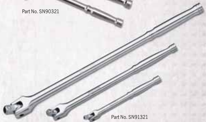
Part No. SN91321