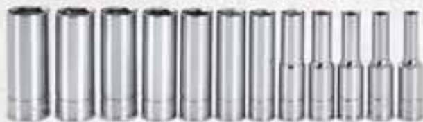
Part No. SN14501