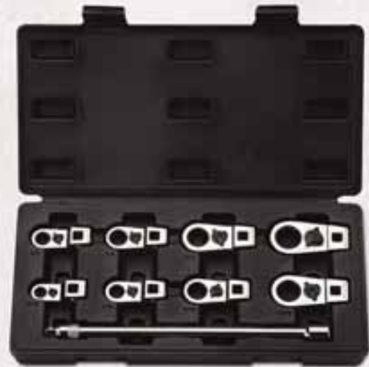
Part No. SN24010