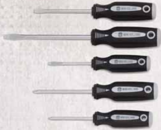
Part No. SN80001