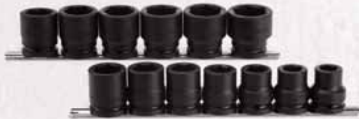
Part No. SN41001