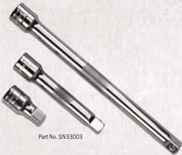
Part No. SN33003