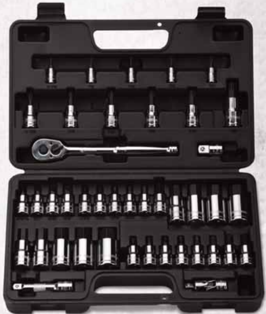
Part No. SN18001