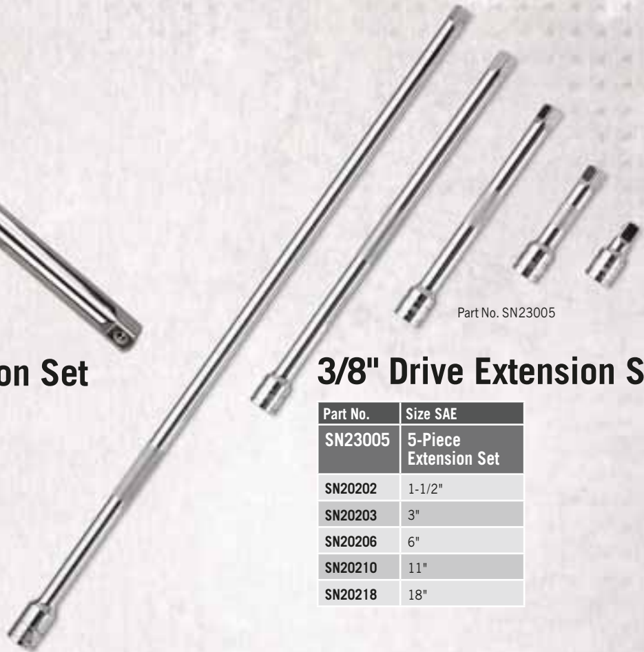
Part No. SN23005