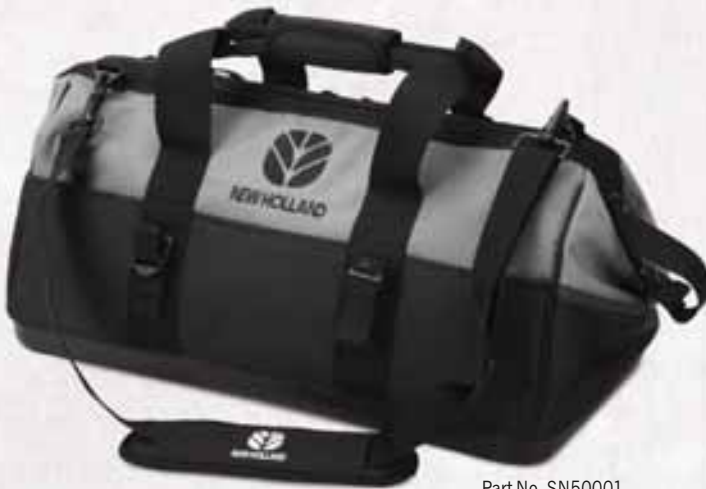
Part No. SN50001