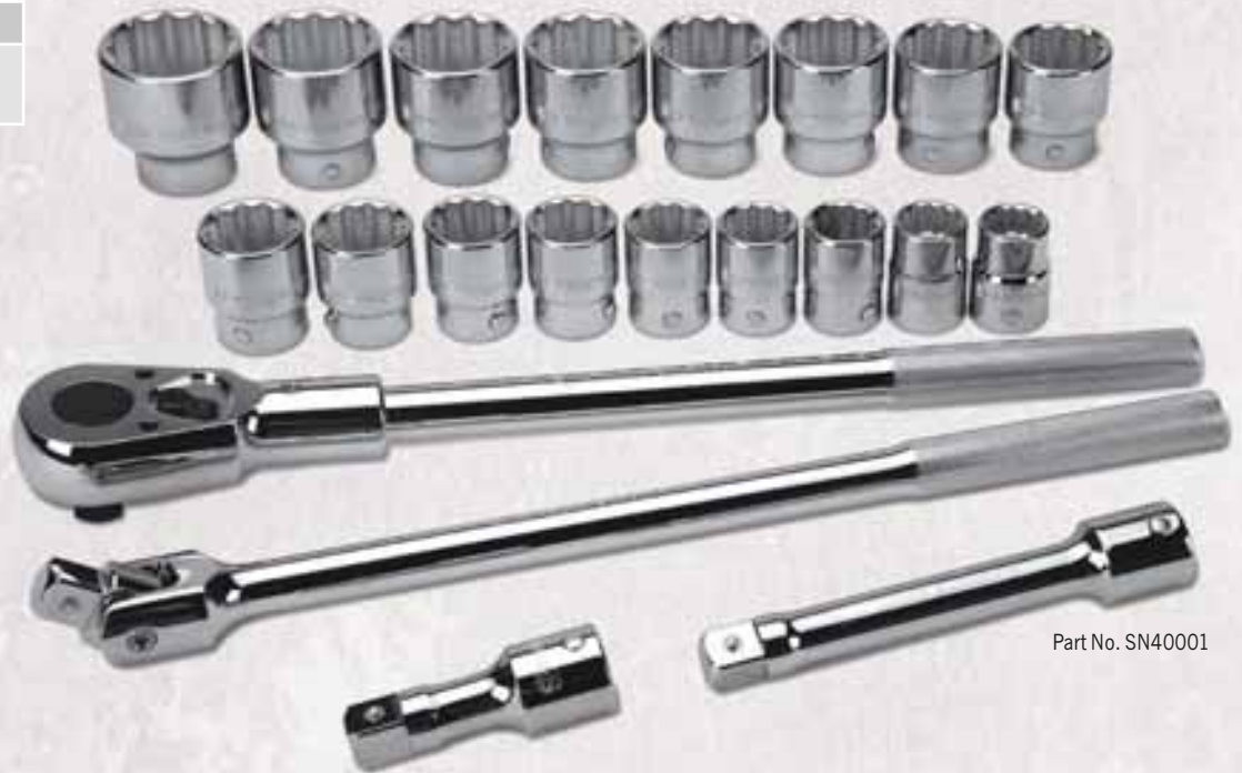
Part No. SN40001