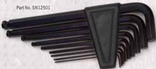
Part No. SN12501