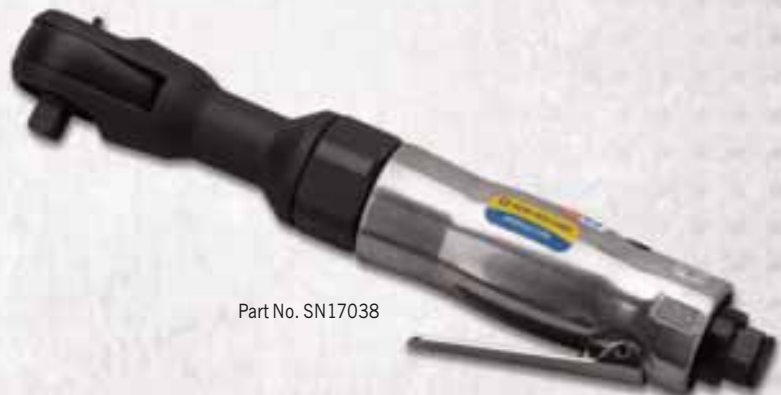
Part No. SN17038