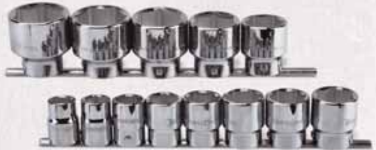
Part No. SN40501