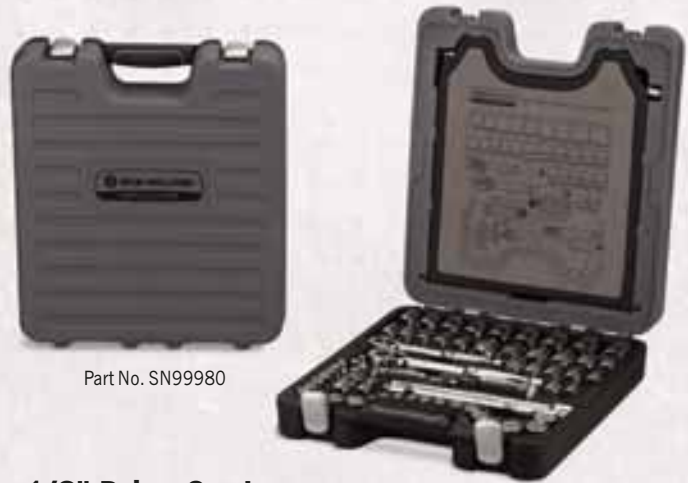
Part No. SN99980