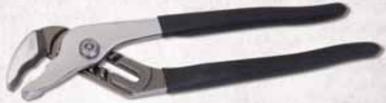
Part No. SN90049