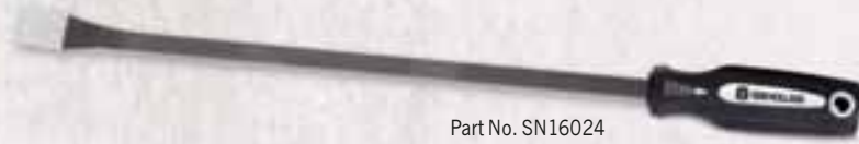
Part No. SN16024