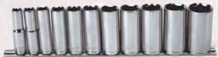
Part No. SN22001