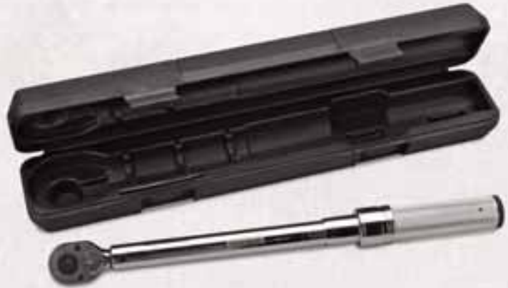
Part No. SN29100