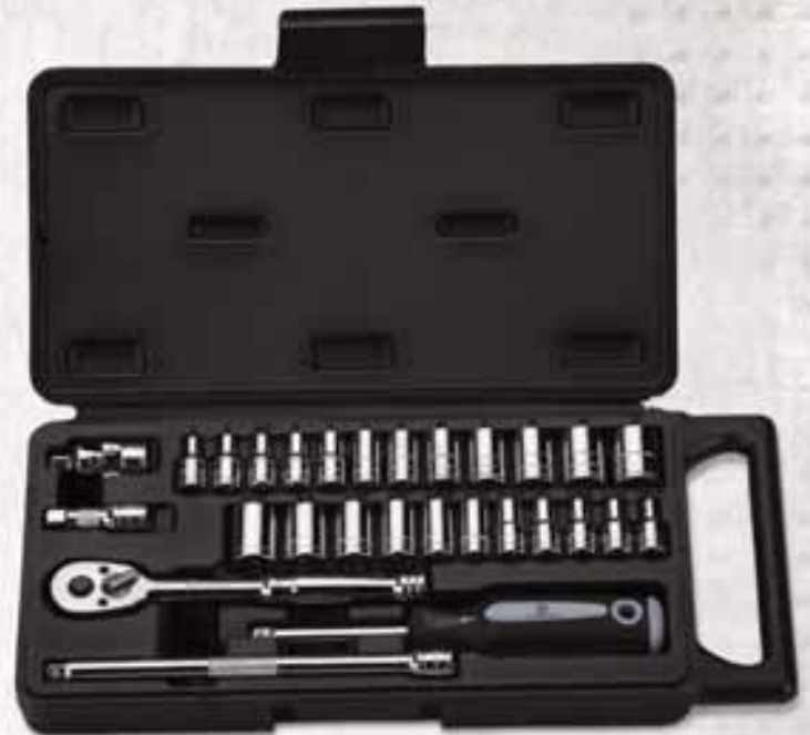
Part No. SN10001