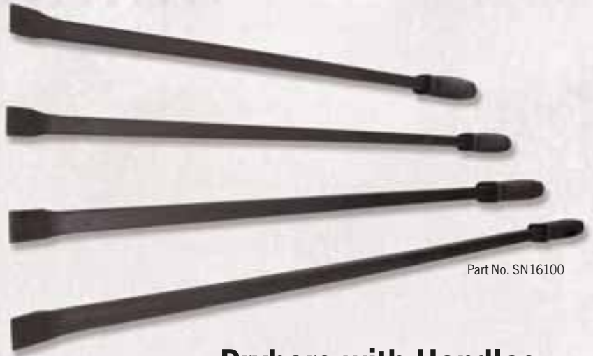
Part No. SN16100