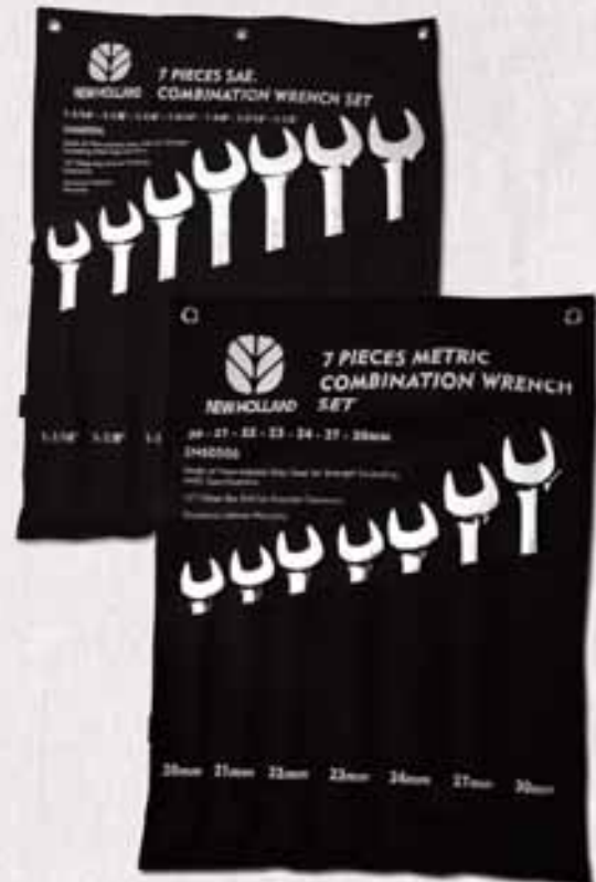
Part No. SN60506