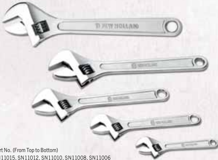
Part No. (From Top to Bottom) SN11015, SN11012, SN11010, SN11008, SN11006