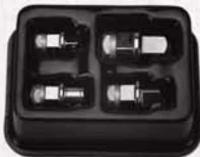
Part No. SN80550

“The highest reward for a person's toil is not what they get for it, but what they become by it.”