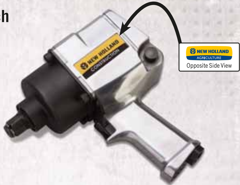
Part No. SN17075