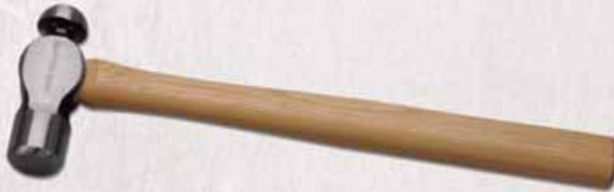
Part No. SN13016