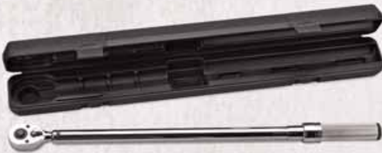
Part No. SN39250