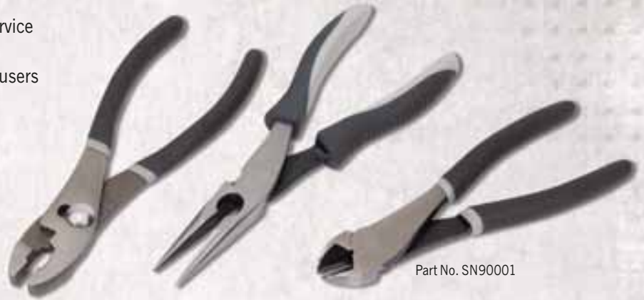
Part No. SN90001