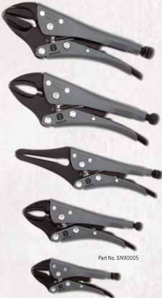
Part No. SN90005