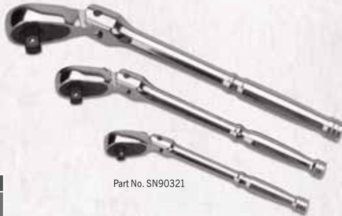
Part No. SN90321