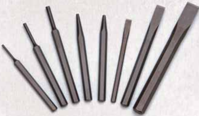
Part No. SN13100