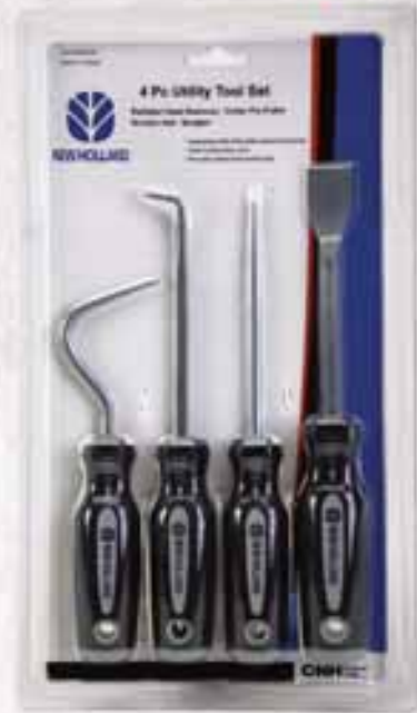
Part No. SN80520