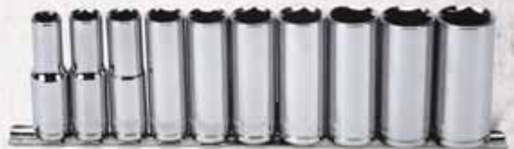
Part No. SN32001