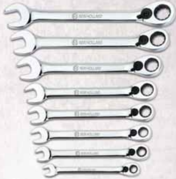
Part No. SN70001