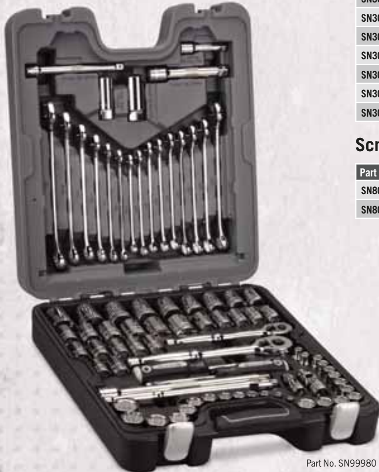
Part No. SN99980